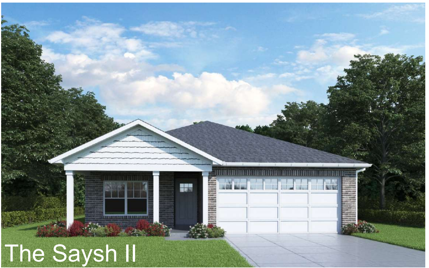
The Saysh II